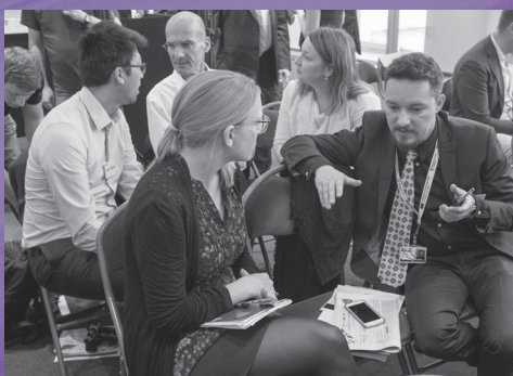
SPEED NETWORKING SESSION